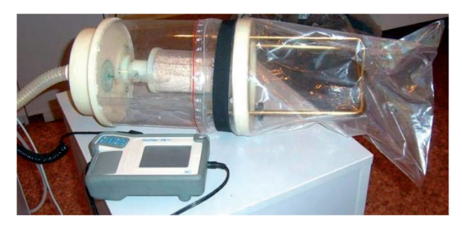
Figure 5 A laboratory image representing the Rebreather Hypoxytron® (Ukraine) device, which is capable of buffer reservoir volume regulation for individual hypoxia dosage. (A color version of this figure is available in the online journal.)

rest (by 5.8%) and during mild exercise (by 18.8%). The antihypertensive effects persisted for two months. Another study from this group was conducted in 45 elderly patients with stable angina and I and II functional classes. 29 They used a "Hypoxytron" device as shown in Figure 5. Each IHT session consisted of four cycles of 5 min hypoxic mixture breathing (12–14% oxygen) alternated with 5 min air breathing. The IHT by "Hypoxytron" device was well tolerable and safe for vast majority of healthy elderly control subjects and elderly patients with ischemic heart disease. IHT led to the reduction in clinical symptoms of angina and of daily myocardial ischemia duration, normalization of lipid metabolism, and increased exercise tolerance. IHT also had positive effects on hemodynamics, microvascular endothelial function, and work capacity in healthy senior men.<sup>27</sup>