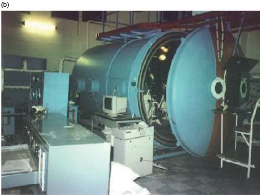
Figure 2 (a) The barochamber Ural-1 USSR (Orenburg Medical University, 1970–1990). (b) The training thermo-barochamber in Terskol, International Medico-Biological Scientific Centre, Russia-Ukraine (1970 to present). This large climatic test bench can reconstruct the atmospheric conditions equivalent to 9000 m altitude. (A color version of this figure is available in the online journal.)

diseases in humans may carry its own risks and a third of the patients subjected to hypobaric IHT in simulated altitude chambers had side effects such as headache, stenocardia, and cardiac rhythm disturbances. Furthermore, barochambers for human use are often expensive to build and demand personnel with necessary medical specialty skills, which may not be practical in many healthcare settings. To determine and control the appropriate hypoxia dosage for each individual patient in the settings of hypobaric chamber is also a great challenge. It was suggested that intermittent hypobaric hypoxia may produce harmful biochemical changes, including decreased antioxidant capacity and increased lipid peroxidation, which may lead to suppression of vascular endothelial function and impairment of vascular hemodynamics.<sup>67</sup>