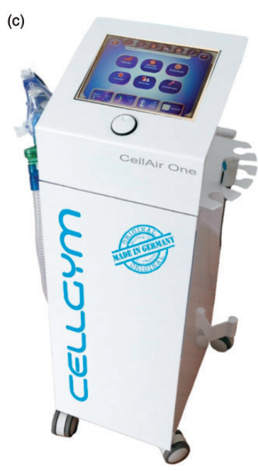
Figure 4 The commercial image representing: (a) and (b): AltiTrainer200® (Switzerland). (c) CellAir One® (Germany), a device for hypoxic–hyperoxic training. (A color version of this figure is available in the online journal.)